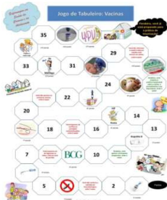
Figure 1- Board game for the theoretical game section for teaching immunization to nursing students. Cuiabá, MT, Brazil, 2020.

To conclude, the fifth game is a true or false game, elaborated in the Kahoot!® application, composed of thirty-two statements about the Epidemiological Surveillance of Post-Vaccination Adverse Events and each group has to respond according to what they believe, whether they find it is true or false. The team with the more correct answers scores 10 points in the competition. All doubts expressed by the students are also clarified after the end of the game. The group with the highest score wins.